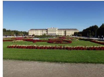
Schonbrunn Palace (Vienna)

Our Rhine cruise started in Amsterdam, Netherlands and ended in Basel, Switzerland, stopping in Germany (Cologne, Koblenz, Mannheim, Heidelberg) & France (Strasbourg). Amsterdam is a beautiful city, as were all of the other stops on this cruise, but the upper Rhine is not as scenic as the Danube.