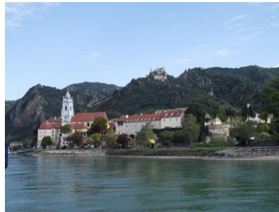
Town or Durnstein