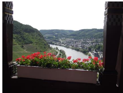
Moselle River from Reichsburg Castle